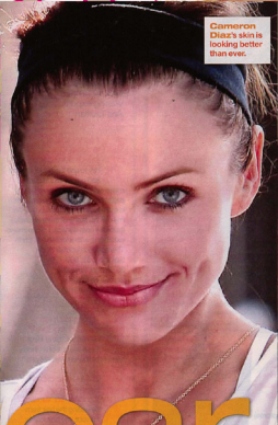
Cameron Diaz's skin is looking better than ever.