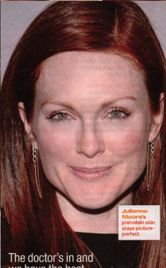
Julianne Moore's porcelain skin stays picture-perfect.

ly meets parents cky and family to r own